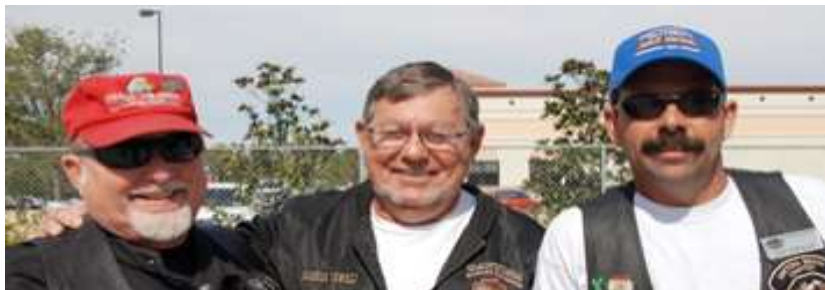
Drill Team Instructors