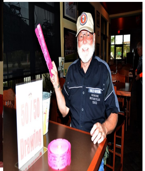
Some of our Great Volunteers!