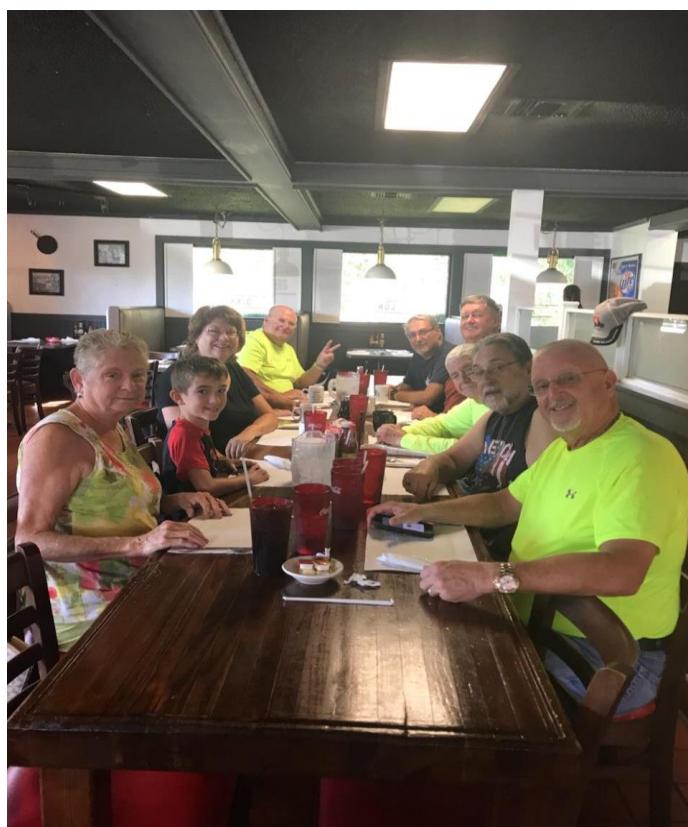
Warm but enjoyable Breakfast Ride to The Chicken Pantry – Rt.100 – Bunnell, FL.