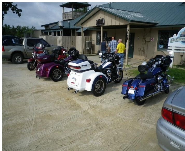
Refreshing, morning ride to Bull Creek Fish Camp for an enjoyable breakfast