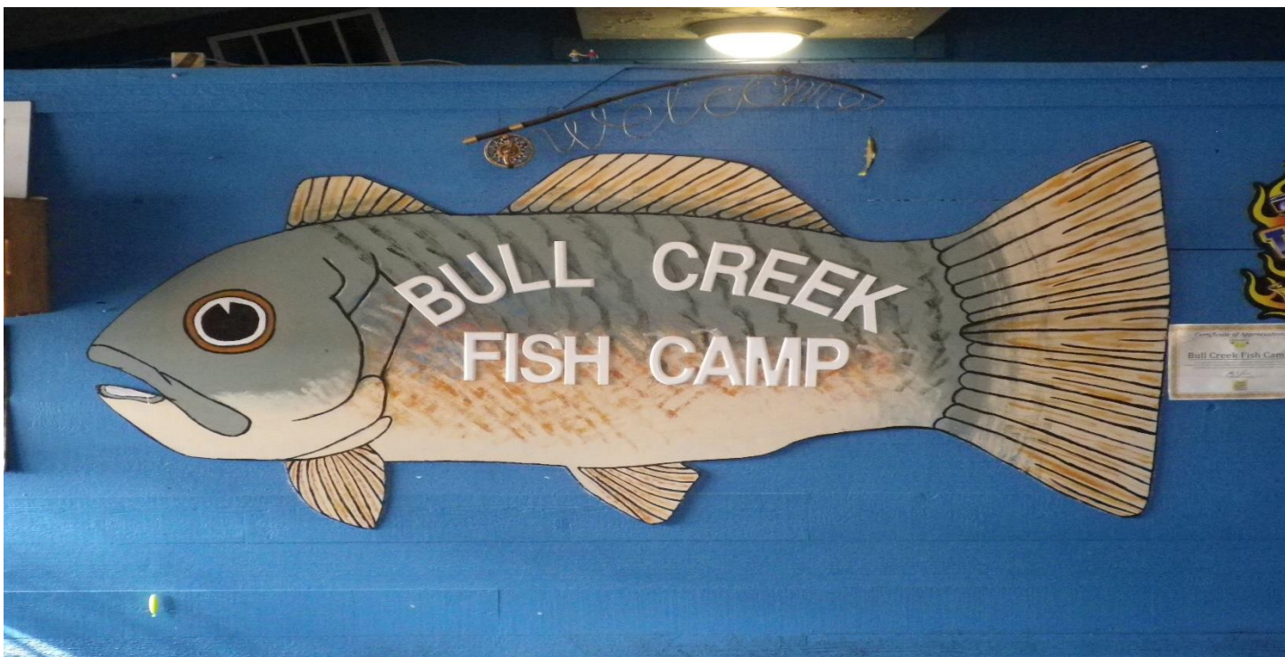
Bull Creek Fish Camp Ride