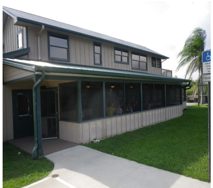
Bull Creek Fish Camp on Crescent Lake [East Side]