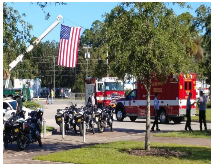
Leaving the Flagler Co. Administration Bldg.