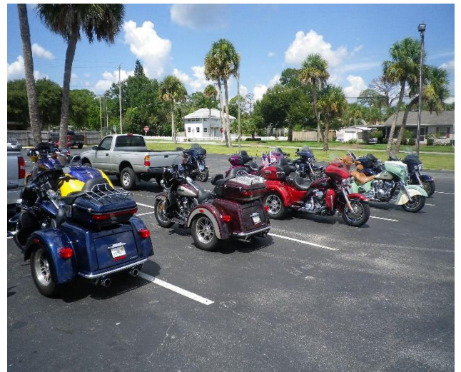
The numerous Trikes [and owners] who attended the Dealership's first TRIKEFEST. Ride to Titusville, 'Dogs-R-Us'