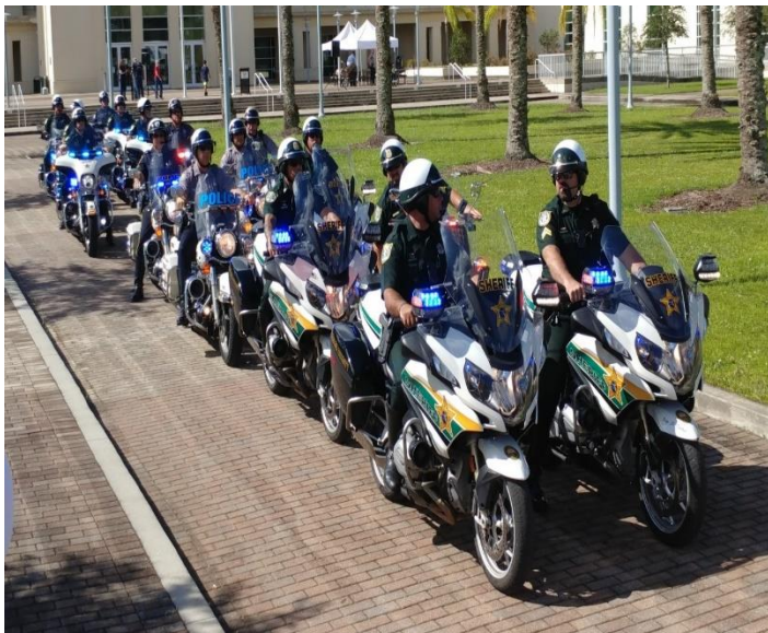
ALL Counties SHERIFF DEPT. motorcycle escort