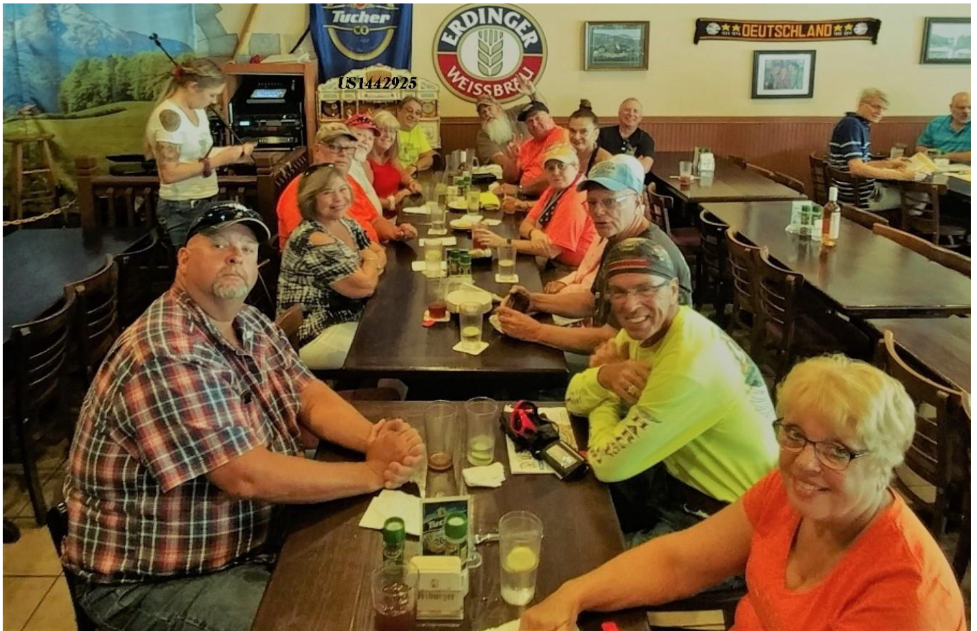
A good turn-out of HOG Chapter members at the 'Birthday' Ride to Hollenbachs in Sanford