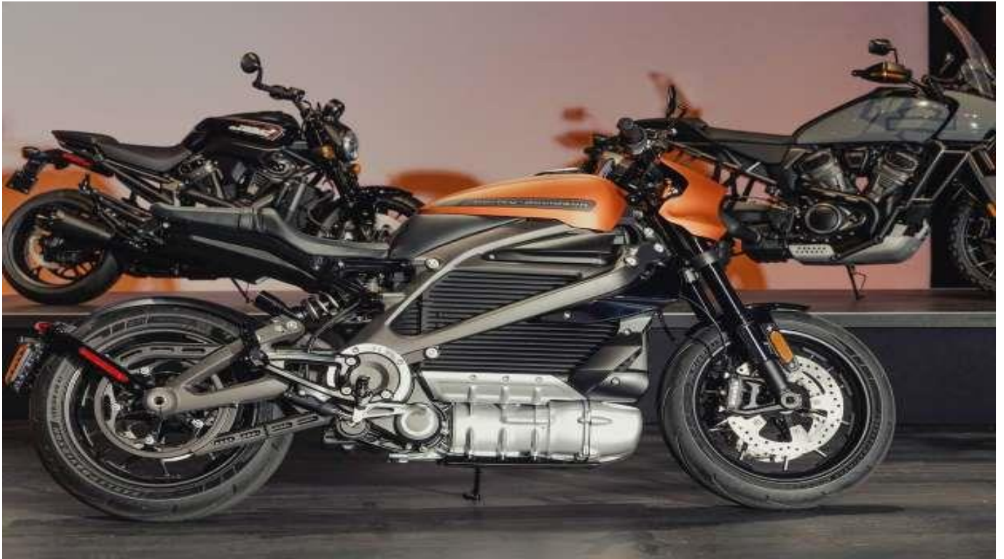
The Harley-Davidson "LIVE WIRE" electric motorcycle due out soon [possibly by 2020]