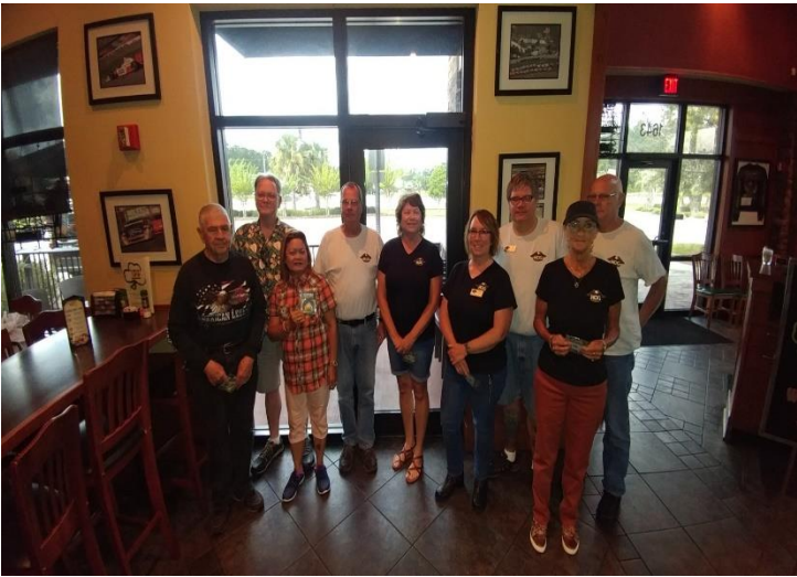
Some of the winners for the "Let's Go Park'N" Ride

"Where we've been . . . What we're doing"